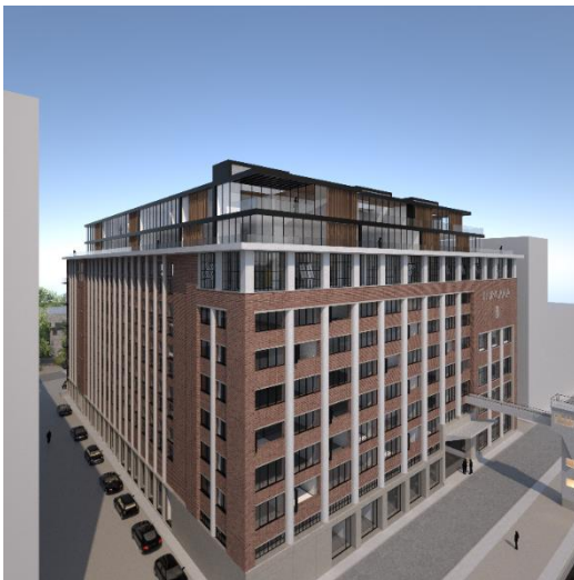
Vaartkom / Eynattenstraat